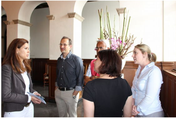
Roermond Peer Review, July 2016