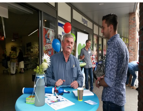
Meeting citizens in Roermond