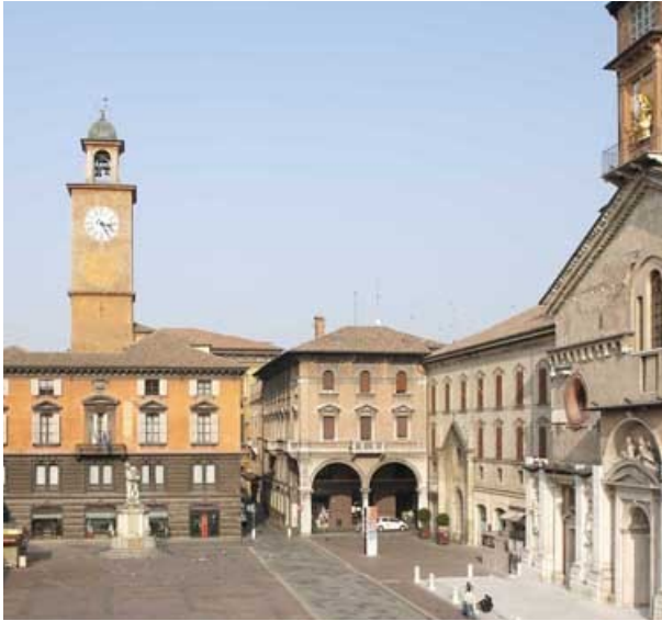
Reggio Emilia, Prampolini Square