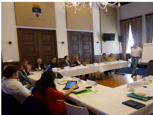
RESOLVE Kick Off meeting, Roermond, April 2016