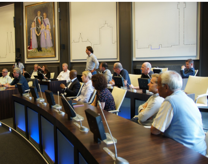
Roermond Peer Review, July 2016