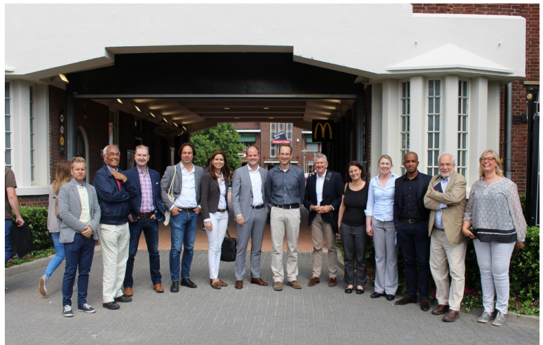
Experts from Portugal, Sweden, UK and the Netherlands at Roermond Peer Review

peer review each other's mobility plans, using the EC's SUMP Guidelines; identify good practices , for possible import; develop robust Regional Action Plans that will propose both new projects and improved governance devise, test and propose a Monitoring and Evaluation Tool for ex-ante and ex-post appraisal of policies and initiatives in the field of sustainable mobility and retailing.