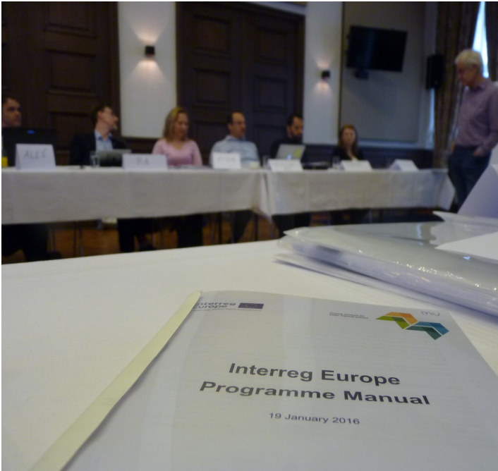
RESOLVE Kick Off meeting, Roermond, April 2016

How can commercial travels of people and goods be more energy-efficient and sustainable? How to improve the local environment in commercial areas in terms of noise, congestion, pollution and attractiveness? How can cities and regions contribute to the flagship initiative for a resource efficient Europe under the Europe 2020 strategy supporting the shift towards a resource efficient, low carbon economy to achieve sustainable growth?