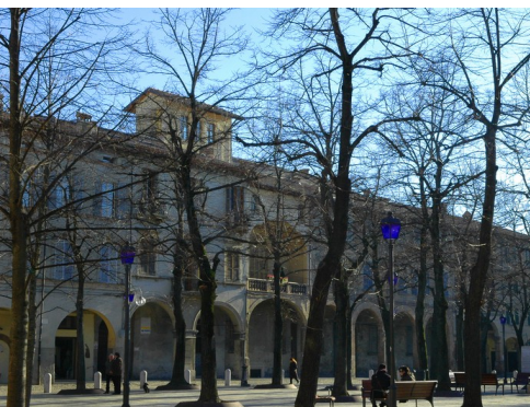
Reggio Emilia, Tricolore Room, Calatrava Bridge, Fontanesi Square

The city is now engaged in the realisation of the SUMP (Sustainable Urban Mobility Plan) that will be finalised in 2017 and will contain the vision of the new mobility system to 2025.